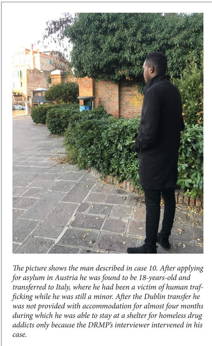
The picture shows the man described in case 10. After applying for asylum in Austria he was found to be 18-years-old and transferred to Italy, where he had been a victim of human trafficking while he was still a minor. After the Dublin transfer he was not provided with accommodation for almost four months during which he was able to stay at a shelter for homeless drug addicts only because the DRMP's interviewer intervened in his case.

He only received legal assistance from the DRMP's interviewer as the SPRAR centre only offered basic information on the asylum procedure.