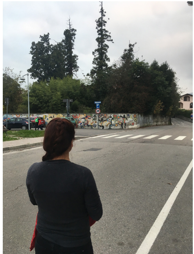
The picture shows the woman described in case 5, who was diagnosed with PTSD and with a high risk of suicide prior to being transferred from Switzerland to Italy. She was not accommodated until 14 days after the Dublin transfer, after which she was accommodated as the only single woman at a CAS centre with about 40 men.

Upon arrival at the all-female CAS centre her mental health had deteriorated due to the conditions at the all-male CAS centre. However, due to the fact that she was transferred to a different centre, she had to wait two months before she could get a new appointment with a psychologist, which only happened after the DRMP's interviewer intervened in the case. In order to continue her treatment, she had to pay to have her medical files from Switzerland translated to Italian, and she still had to ask an acquaintance to provide translation for the sessions with the psychologist.