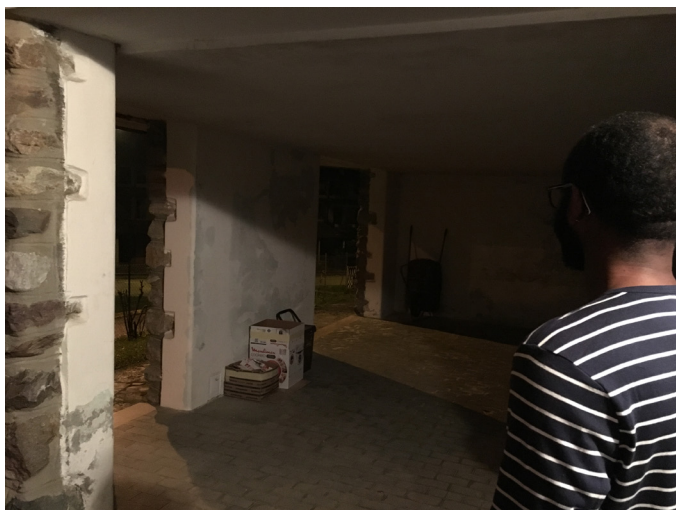
The picture shows the male victim of human trafficking described in case 12. Despite being a victim of human trafficking, he has lost the right to accommodation twice since the Dublin transfer, and now lives on the streets in Italy.

Prior to entering Italy, he had been sold twice in Libya. In Italy, he was detained in an apartment building together with other men and women. He was detained by the trafficker who had brought him from Libya. The traffickers said the trafficked persons owed them money and had to repay by working as prostitutes or by selling narcotics. After two weeks he managed to escape and reached Germany. In Germany he met persons from the same trafficking network. They beat him and gave his phone number to the trafficker in Italy, who then threatened him on the phone. Feeling unsafe in Germany, he traveled to Denmark, from where he was returned to Italy. To help him be recognized as vulnerable by the Italian authorities upon arrival, the Centre Against Human Trafficking in Denmark had issued him a note stating that he is identified as a victim of human trafficking.