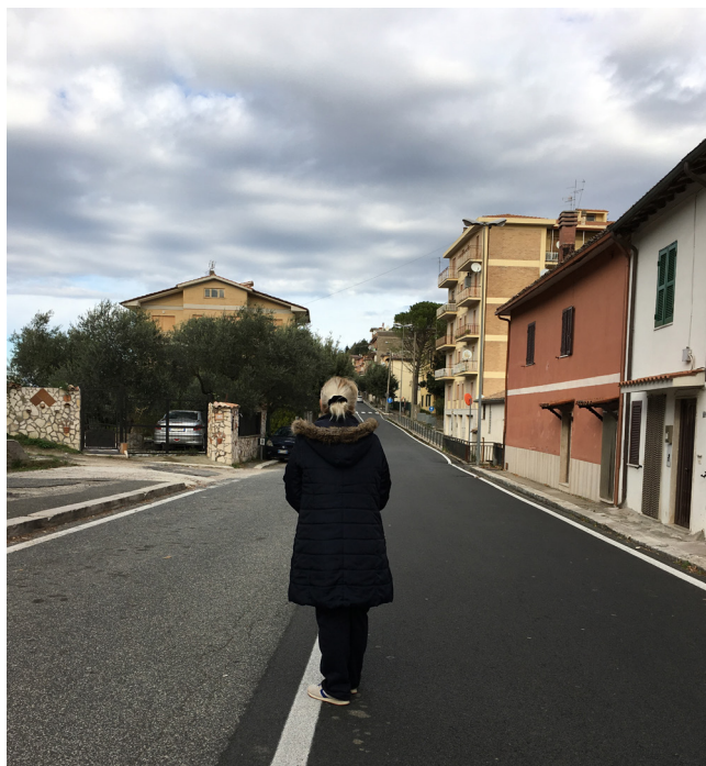
The picture shows the woman described in case 8, who suffers from complex trauma and whose mental health deteriorated following the Dublin transfer, after which she was accommodated at a large CAS centre.

She found the second CAS centre to be very dirty and more isolated than the first centre. Upon arrival she had an allergic reaction, apparently because of the unhygienic conditions, as she shares a bathroom with 15 people, which is constantly dirty. Shortly after arrival she suffered a mental break down as she could not cope with the new surroundings. As a result, she was offered a key to a private bathroom, which she could use until the bath stopped working in November 2018. Following her break down, she was also offered a